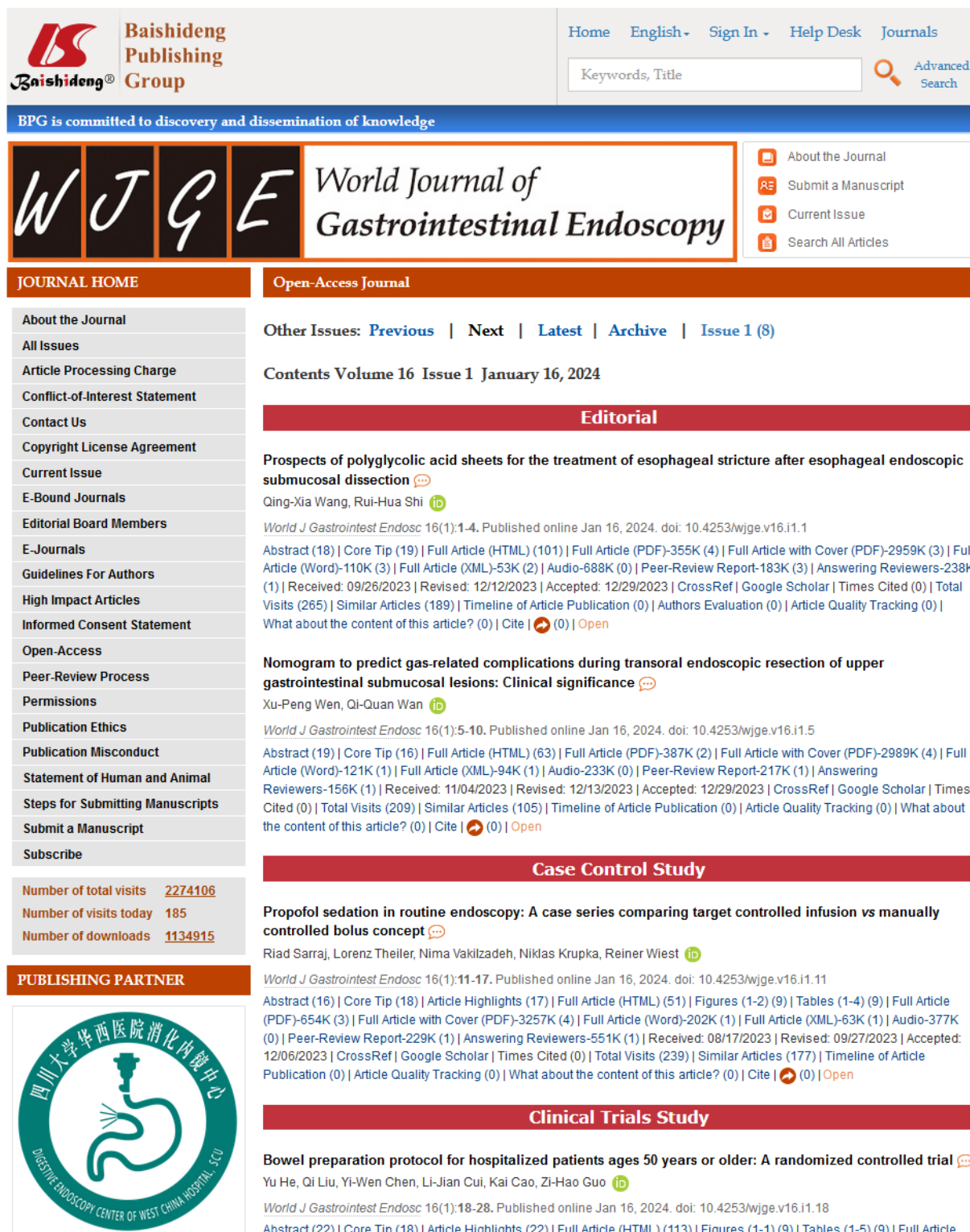
图 1 <四川大学华西医院消化内镜中心>作为 WJGE 的协办单位，其标识 Logo 在期刊主页