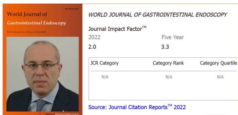
图 3 WJGE 2022 年影响因子。

WJGE 目前被 Emerging Sources Citation Index (ESCI, Web of Science)、PubMed、PubMed Central、Reference Citation Analysis、中国科技期刊数据库和超星期刊数据收录。根据 2023 年版 Journal Citation Reports , WJGE 2022 年影响因子: 2.0, 5 年影响因子: 3.3 (图 3)。