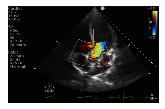
Figure 1 Transthoracic echocardiography apical 4 chamber view showing a small peri membranous ventricular septal defect with a left to right shunt (orange arrow).