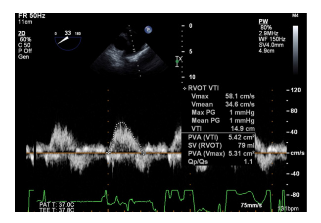
Figure 2 Continuity equation to calculate shunt fraction Qp:Qs using transesophageal echocardiography.