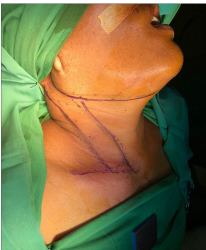
Figure 2 Surgical site marking.